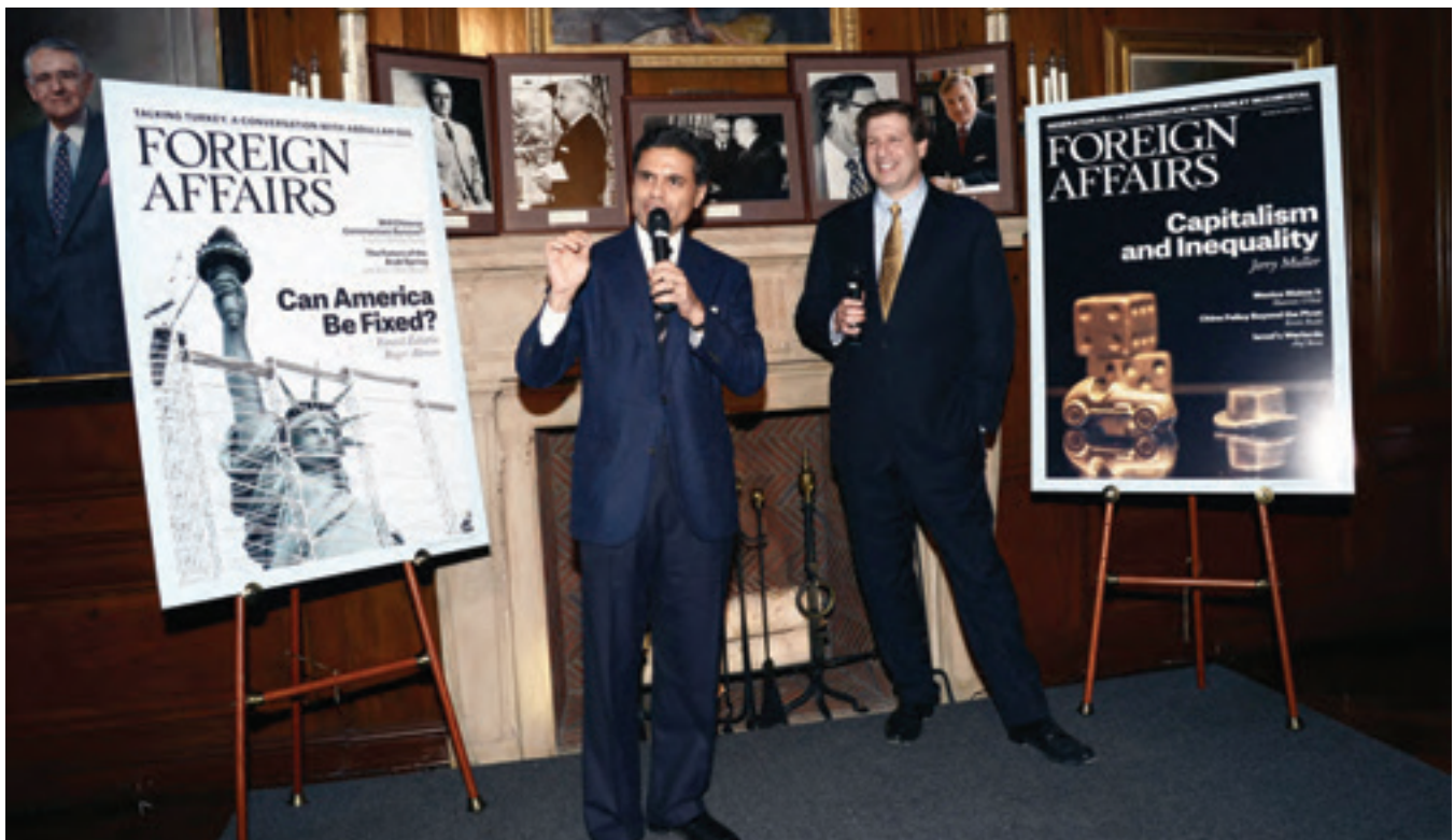
Fareed Zakaria and Gideon Rose unveil the cover of the Foreign Affairs March/April issue.