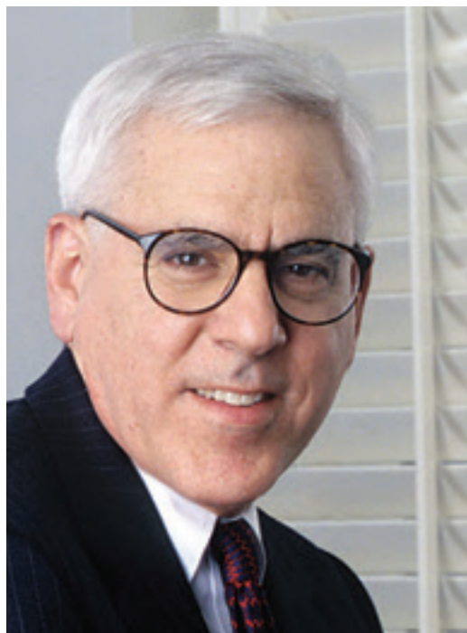
Vice Chairman David M. Rubenstein

Carla A. Hills Robert E. Rubin Co-Chairs of the Board