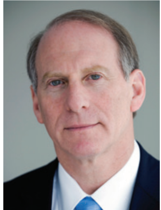
President Richard N. Haass

For nearly a century, CFR scholarship has covered traditional foreign policy topics, such as national security, trade, and diplomatic relations, along with the most important and, in many cases, most volatile regions and countries. We continue to study these issues, but we have also expanded our intellectual agenda to address matters such as child marriage; girls' education; cybersecurity; the domestic underpinnings of U.S. power, including debt and deficits, immigration, infrastructure,