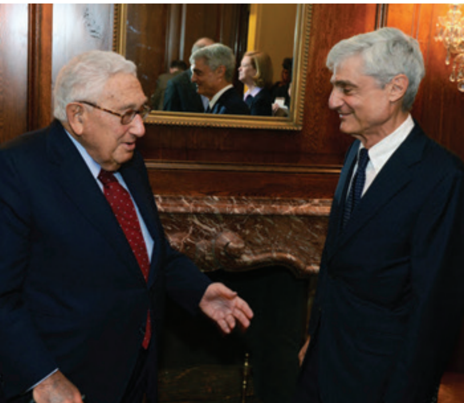
Former U.S. secretary of state Henry A. Kissinger greets former U.S. treasury secretary and CFR Co-Chairman Robert E. Rubin at the tenth annual Corporate Conference.

Though the past ten years have been marked by change, the traditional mission of CFR endures: to help our membership and others better understand the world and the foreign policy challenges facing the United States.