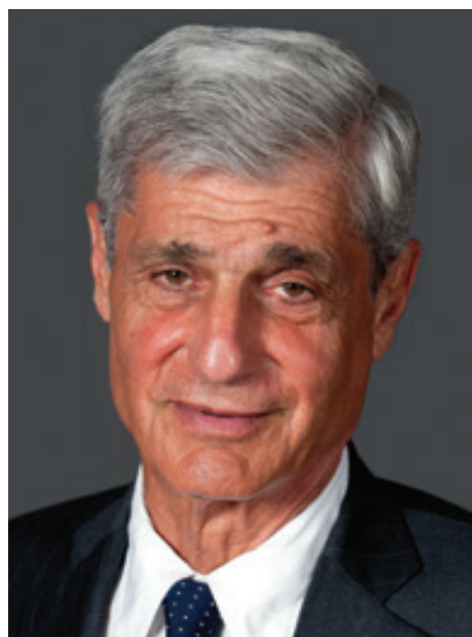
Co-Chairman Robert E. Rubin