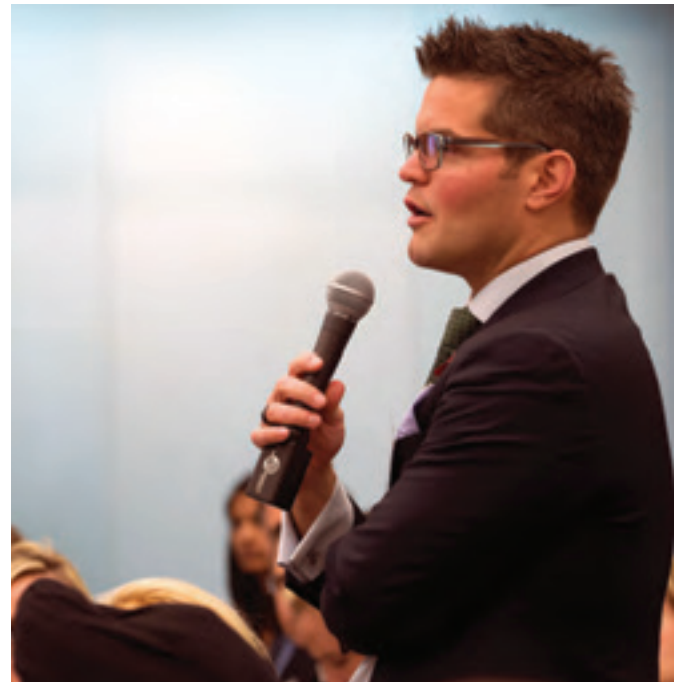
Above: A term member speaks at the seventeenth annual Term Member Conference, held at CFR's office in Washington, DC, on November 8 and 9.